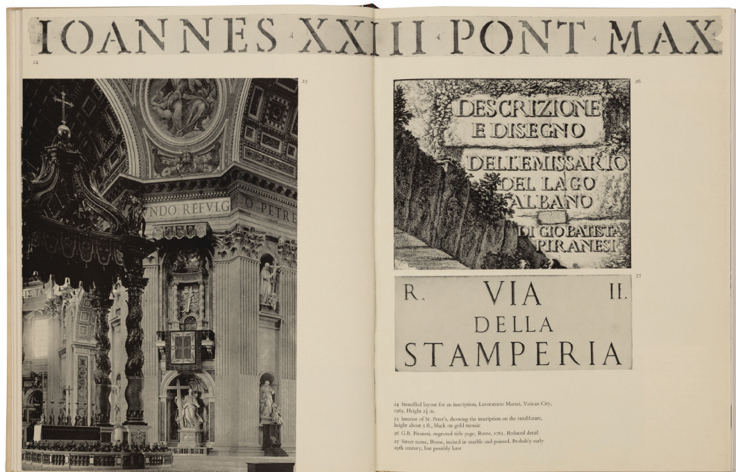
Figure 2. James Mosley, “Trajan revived”, Alphabet (1964), showing revived forms of antique Roman inscripational letters.